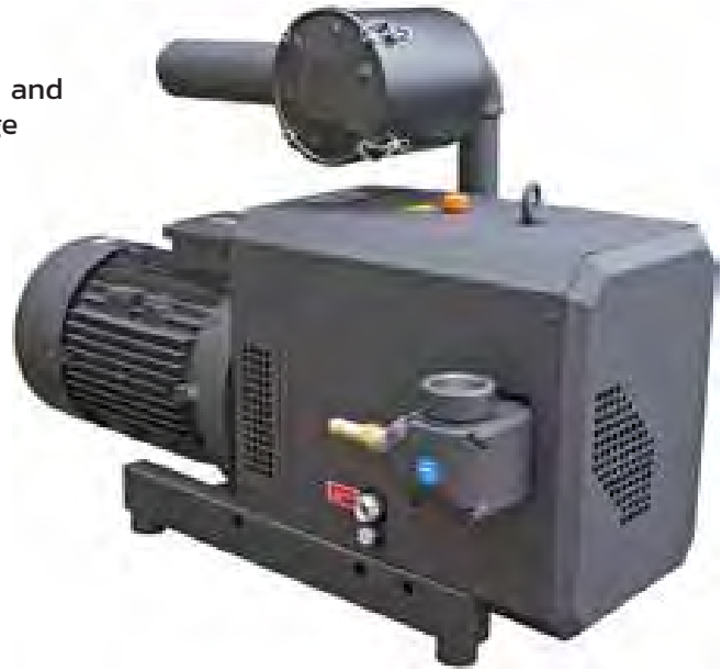
Oil-less Rotary Claw Compressor

Standard models include an inlet silencer, inlet filter, and a pressure regulator. They are fitted with Nema flange motors, available in both standard and XP versions. Each model includes its own unique combination of motor, coupling/fan assembly, and pressure regulator. Performance curves for flow and pressure ratings of each compressor are on the next page.